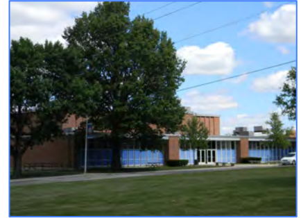
Weis Memorial Gymnasium