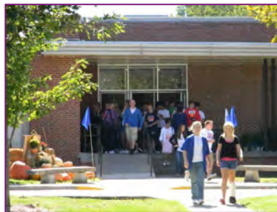
Krueger Dining Hall