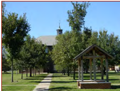
Baepler Hall & Victory Bell