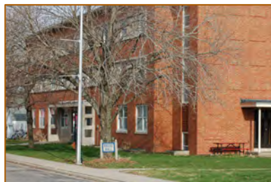
Brust Hall (Boys' Dorm)