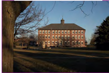
Baepler Hall (Education Building)