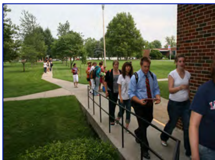
Students walking from Fine Arts to Baepler Hall