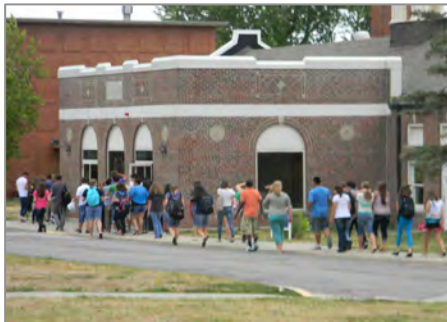
Kaepfel Hall (Chapel)