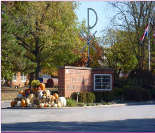
Entrance to Saint Paul