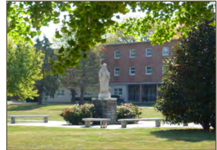
Moeller Hall (Girls' Dorm)