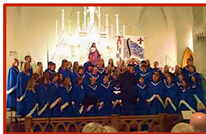
The Singing Saints of Saint Paul Lutheran High School

1997 were selected to perform at the Missouri Music Educators Association Convention. In 1994, 2006, and 2013 the Saint Paul Choir participated in a mass choir performance at Carnegie Hall in New York.