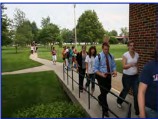
Students walking from Fine Arts to Baepler Hall