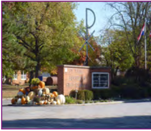
Entrance to Saint Paul