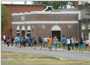
Kaeppl Hall (Chapel)