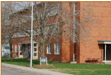
Brust Hall (Boys' Dorm)