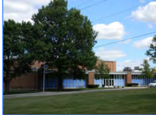
Weis Memorial Gymnasium