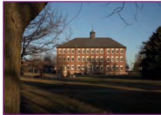
Baepler Hall (Education Building)