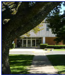
Fine Arts Building