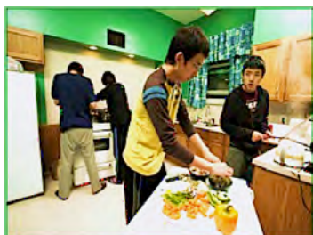
Brust Hall Kitchen

Students attending Saint Paul as residential students are required to live in the residence halls with other students and a dorm counselor. Students living in the residence halls enjoy being with their friends 24 hours a day. Along with student rooms, the residence halls have bathrooms, laundry conveniences, recreational areas and a common kitchen on the first floor. Each student's room has an air conditioner and can be fitted with a small refrigerator. Each room in Moeller Hall (girls' residential hall), Brust Hall (boys' residential hall) and Heilman Hall (boy's residential hall) are now equipped with Ethernet connections. Students can bring a laptop and a small stereo. No more than two students per room. Individual rooms are available for an additional fee.