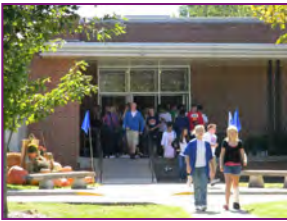
Krueger Dining Hall