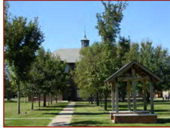
Baepler Hall & Victory Bell