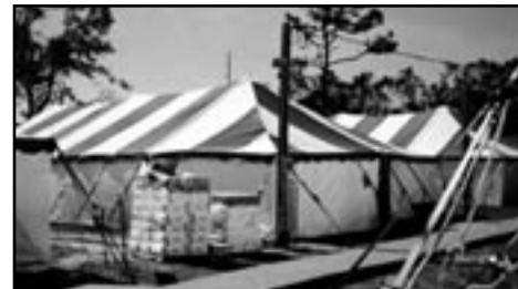
An LDR Camp Biloxi tent city.

Nine months later, emotions are still often on edge as houses are razed and create new piles of debris. When rebuilding seems underway, other homes are declared unsafe. Any time you think things are getting back to normal, all one has to do is drive near a waterway where the land has been stripped of its beautiful homes as much as a half mile inland for more than 150 miles; 2,500 LCMS families have been displaced from their homes, jobs and, in some cases, families.