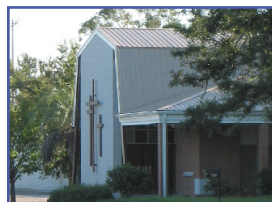
Holy Trinity Lutheran Church under the majestic Live Oaks.

Perhaps it's the trees that tell the story about the recovery following Hurricane Katrina. It's a story of destruction and the slow but progressive restoration. It's a story of change hopefully for the best when all is said and done.