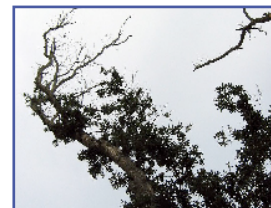
A main branch of a Live Oak tree as its fingers reach heavenward.

Today, more than a year after Katrina, a few of the oaks have succumbed, and the rest struggle to recover. New leaves now grow all along the twisted, main branches, but the fingerling twigs usually bearing the leafy covering are still bare and pleading for help.