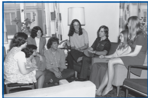
Moeller Hall lounge has always been a popular meeting place.

Moeller Dorm will celebrate its 50th year in the month of October (Moeller Hall and Weis Gymnasium were dedicated on the same day). Because of the increase of female students at our synod's teacher colleges, St. Paul's College began to admit women in 1954. The first female students stayed in a refurbished faculty home until the girls dorm could be built.