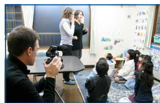
Filming an English class being taught by LCMS missionaries in Tokyo, Japan.

In 2006 I graduated from the University of Missouri and moved to St. Louis to begin working for a small advertising agency. I saw it as a good first step along my planned career path in the world of marketing and advertising. God had something better in mind.