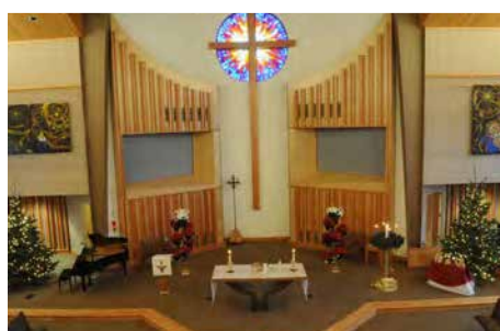
The restored chancel of Living Savior.

Simultaneously, the focus was upon the insurance policy. An adjuster was dispatched and assigned to the claim. There were many, many meetings. In the end, the insurance company virtually divided the claim into two parts. The sanctuary suffered $867,000 worth of damage. It was decided to focus upon that first with the goal of getting the congregation back into it as soon as possible. That ended up being Reformation Sunday (October 30, 2012) – seven months and two weeks after the fire.