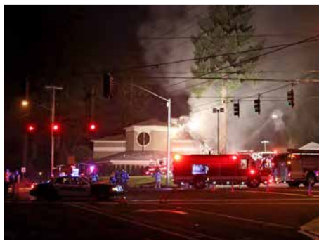
The four-alarm fire brought 64 firefighters to the scene.

"Pastor, we're pouring every ounce of water that Tualatin has on this fire." Those are words that no pastor or parishioner wants to hear, but those words were spoken the morning of March 19, 2012, at about 4:15 a.m. after an arsonist set fire to the facilities at Living Savior Lutheran Church in Tualatin, Oregon.