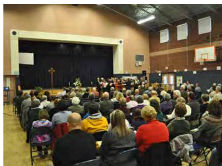
The people of Living Savior worshipping in a school gym following the fire.