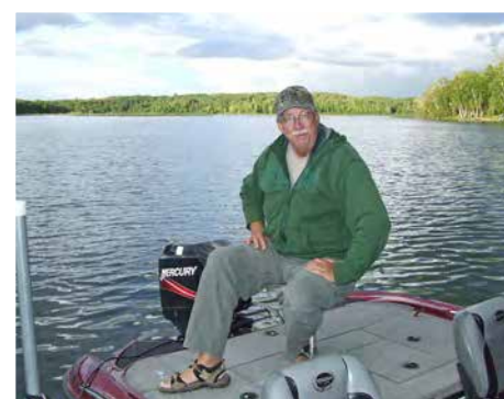
“This is one of my two favorite ‘office chairs’ today...the other is my golf cart.”

But God still surprises me. And I suspect that there are many times left when I will say, “Wow! I never saw that coming!”