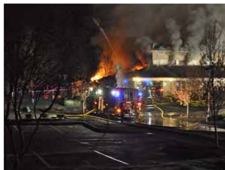
Fire erupts in the preschool area at 4:00 a.m.

The first question on everyone's mind was, "How did this happen?" The answer would unfold over the next couple of days. After bragging to a friend over Twitter about the size of the fire, two fourteen-year-old boys were taken into custody and were being questioned. It soon became apparent that the fire was not an accident.